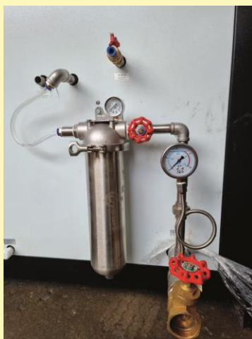
STAINLESS STEEL SUS-304 HOUSING WATER PURIFIER