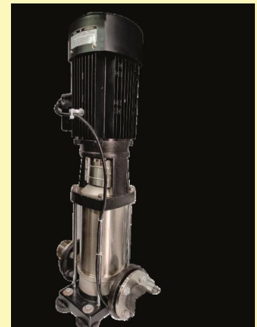
HIGH PRESSURE MULTISTAGE PUMP