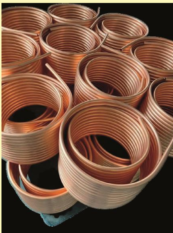
IMPORTED COPPER PIPE