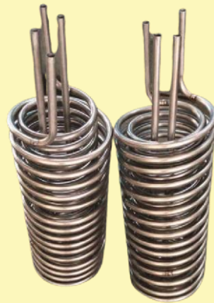
TITANIUM TWISTED PIPE