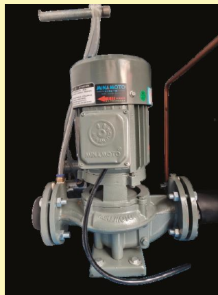
VERTICAL CENTRIFUGAL PUMP