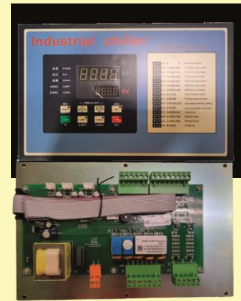
MICRO COMPUTER CONTROL SYSTEM